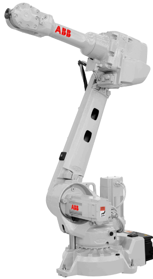
ABB further extends its mid range robot family

The IRB 2600 is the second model in the sharp generation range with enhanced and new capabilities. It is a compact robot with a high payload capacity. The design has been optimized for targeted applications like arc welding, material handling and machine tending. The IRB 2600 is available in three variants, with options for floor, wall, shelf, tilted or inverted mounting configurations.